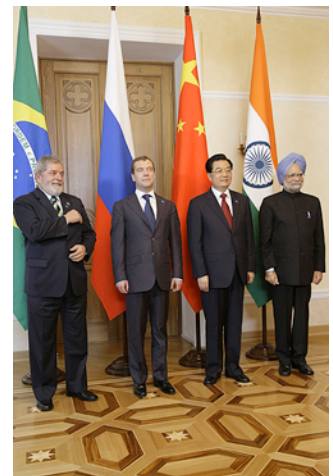
Leaders from the BRIC countries.